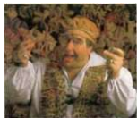
"Sell Good Magical Aids..." J. B. Frobozz

Magic ring . . . . . zm27 Deluxe model . . . . . zm50