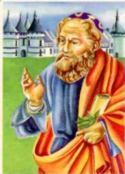
BARBEL OF GURTH, Arbitrator, Diplomat