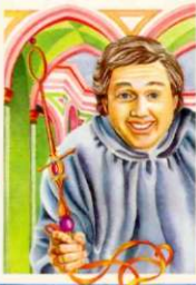
DIMITHIO OF BORPHEE, "The Cheerful Sorcerer" (Founder of the Borphoe Enchanter's Guild)