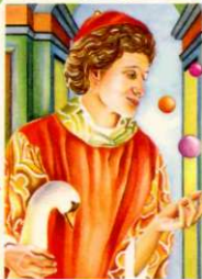
BARSAP, Royal Magician (Turned into a newt, 972)