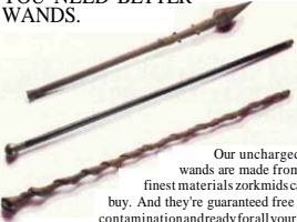
Our uncharged wands are made from the finest materials zorkmids can buy. And they're guaranteed free of all contamination and ready for all your spells.

We have traditional oak, maple, and dogwood, as well as sleek, strong new metal wands. All wands available with or without handle, finished or unfinished. Wands are transported in special music-resistant packaging to eliminate troublesome spell intrusion. For special woods and other materials, write or call. We've been making wands to order for over 200 years.